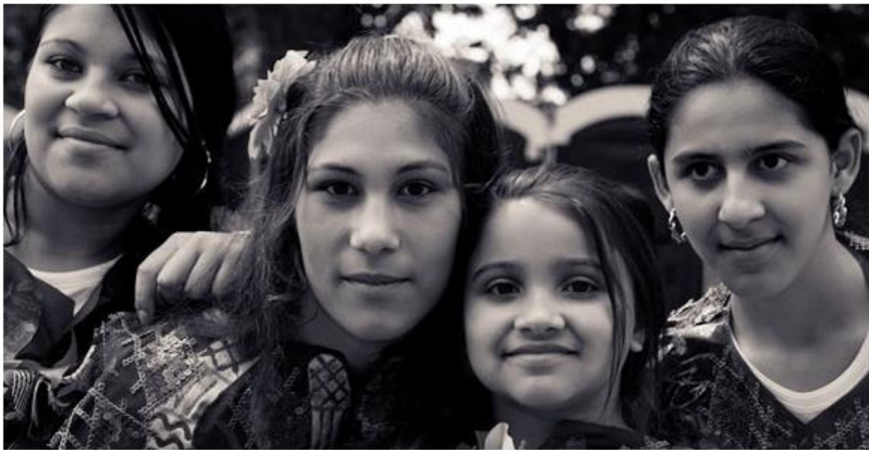
Supporting Motivations to Intervene on Learning and Experience